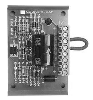
Fike Agent Release Module

Each Clean Agent container shall be provided with a Fike P/N 10-1832 Agent Release Module (ARM III) to allow all electrical actuators to be connected in parallel. Series-wired actuators are not acceptable. The ARM III shall be located at each container and shall be securely mounted in the lower right hand corner of a 4 11/16" (11.9cm) square electrical box, with cover. All wiring to the Clean Agent container and the actuator leads shall connect to a terminal strip located on the ARM III.