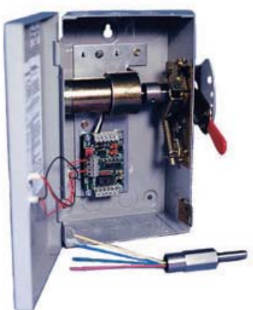
Fike Manual Actuator