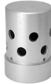
Fike Pre-Engineered Nozzles