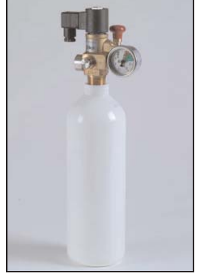
Fireraser Storage Container

Fireraser containers are suitable for use at storage temperatures of +32^{\circ} F to +120^{\circ} F (0°C to 48.9^{\circ} C) with HFC-125 and +32^{\circ} F to +130^{\circ} F (0°C to 54.4^{\circ} C) with HFC-227ea. Each container is shipped from the factory fitted with an anti-recoil device installed on the discharge valve outlet in accordance with USDOT requirements. The anti-recoil device ensures the contents of the pressurized container will be released in a slow, controlled rate of discharge if the valve is opened during the shipping and handling process.